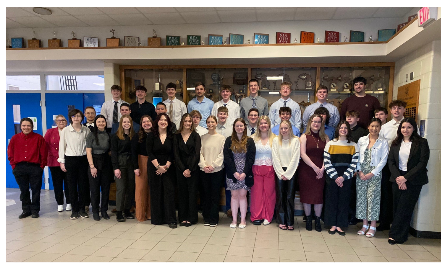
Our seniors recently headed to Mock Interview Day at Mid Michigan College.